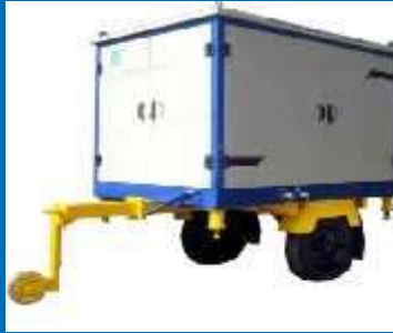
Two Wheel Mounted