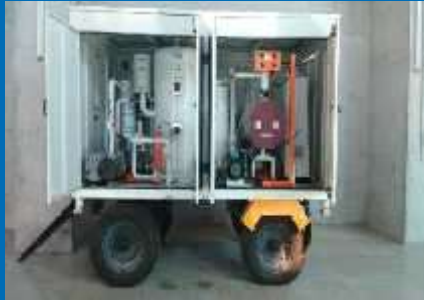
Four Wheel Mounted